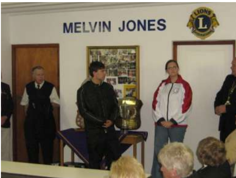
A Bursary recipient and her deaf son. She came to say thanks for allowing her to continue her studies so she will be able to help teach at the school her son attends.